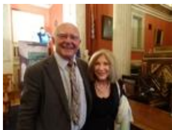
On the occasion of the honorary degree in Athens