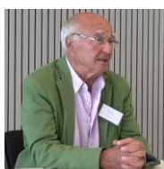
Photo from the AIPPF Congress (2018)