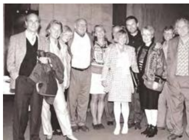
Buenos Aires, AAPPG Congress 1995

In 1982 and 1985, I came across some magnificent texts in which René begins to address the question of internal groups, psychic groupness and the group underpinning of the psyche.